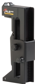
PLS UB9 UB9 universal ceiling/wall bracket