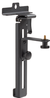
PLS-6200 PLS 360 Ceiling/wall bracket