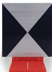
PLS-60620 Reflective laser target