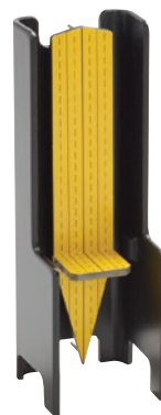
PLS-10090 Pendulum target