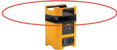
Class II Laser Product