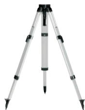
PLS-20512 5/8-11-Thread exterior tripod with 1/4-20 adapter