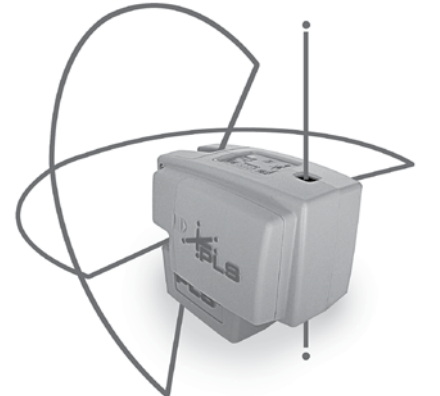
PACIFIC LASER SYSTEMS